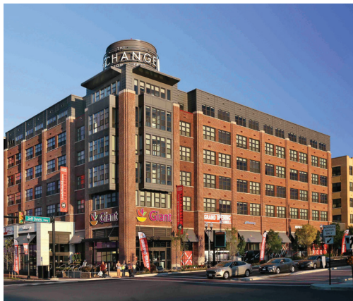
COMMENDATION/GOLD FOR SUSTAINABILITY Notch 8 Alexandria, Virginia

Development Company/Owner: JBG Smith Properties Design Architects: JCA Architects Production/Executive Architects: Torti Gallas and Partner