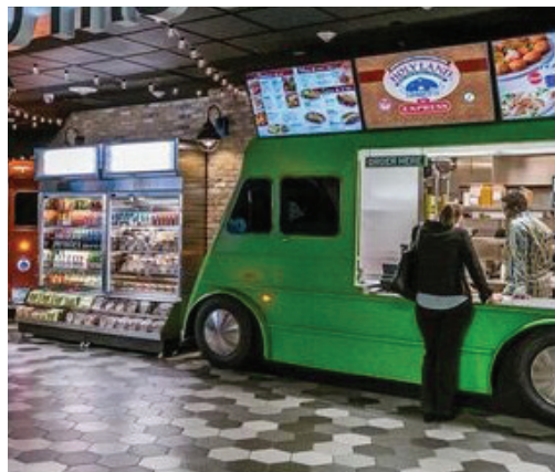
COMMENDATION Food Truck Alley Minneapolis-St. Paul International Airport (MSP) St. Paul, Minnesota

Company: Midfield Concession Enterprises Architects: NORR, LLC