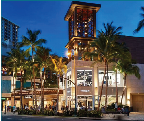
GOLD International Market Place Honolulu, Hawaii

Total Retail Space: 343,000 square feet, Number of Stores: 88 Development Company: Taubman Centers, Inc. Owner: Taubman Centers, Inc. and CoastWood Design Architects: 505Design Production/Executive Architects: JPRA Architects